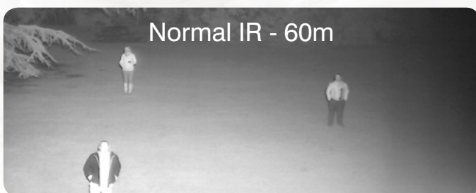
Centre hot-spot and dark edges, reduced distances

The holographic VARIO lenses provide an elliptical (oval) beam pattern and use hot-spot reduction technology (HRT) to enhance the even illumination to standards far in excess of normal LED illuminators. Most illuminators produce a circular beam pattern, but VARIO's elliptical beam is wide horizontally, but more narrow vertically. It outputs less light pollution up into the sky and less light into the immediate foreground, reducing hot-spots or overexposure of subjects which are closer to the camera. Subjects at different depths on scene will be more evenly illuminated – producing a much better CCTV image. With a more focused and targeted beam, VARIO also generates longer distances than traditional illuminators.