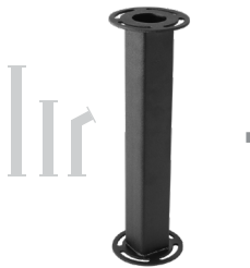
① Mounting Arm

can be customized to any length, reach, or angle*