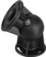
② Omni Mount

360° x 180° mounting allows for positioning at any angle