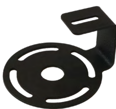
③ Camera Mounting Bracket

can be modified to fit your specific camera if needed*